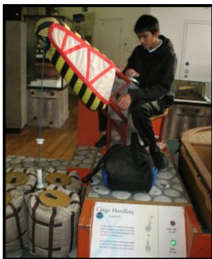
Man at work!