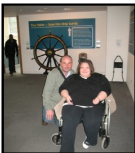
All hands on deck!