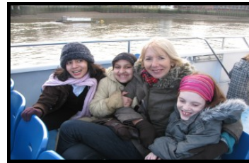
Cruising the River Thames