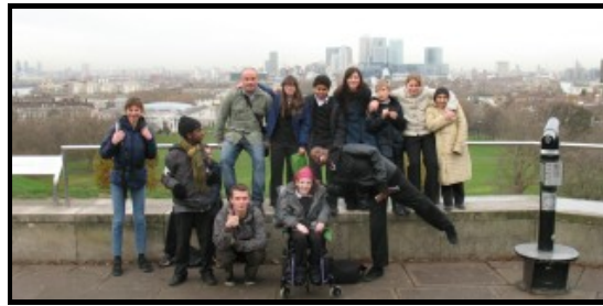
On top of the world!