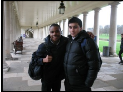
Brothers in arms.