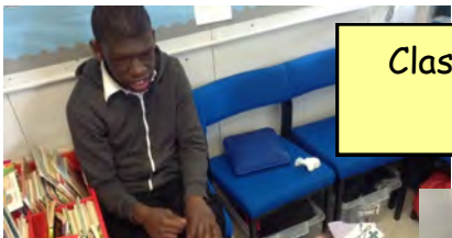
Class 1 become Florence nightingale!